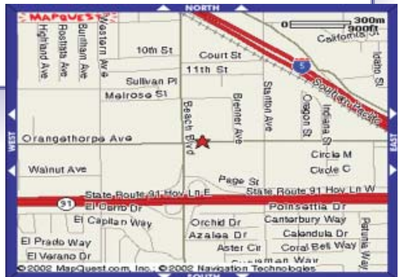
Map for Fuddrucker's General Meetings

Pick up your referral cards and let all those "Z"ers out there know about what a great club we have and welcome them to the next meeting.